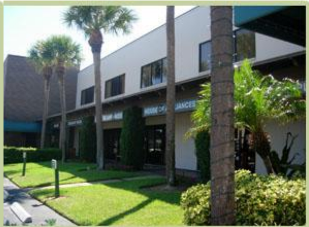
Loggerhead Plaza – 14255 U.S. Highway One – Juno Beach, FL 33408 – (561) 627-2702